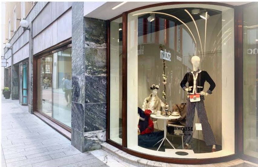
Keep the company AB Piteå, SWEDEN